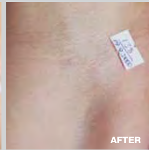
Female Underarm | Post treatment | M. Ercan, M.D.