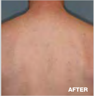
Male Back | 3 months post treatment | J. Waibel, M.D.