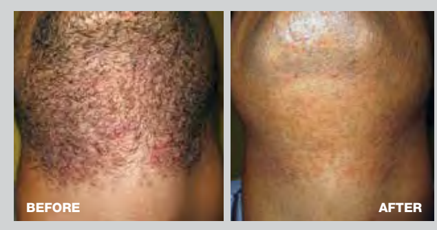
Beard Bumps | Post treatment | O. Zerpa, M.D.